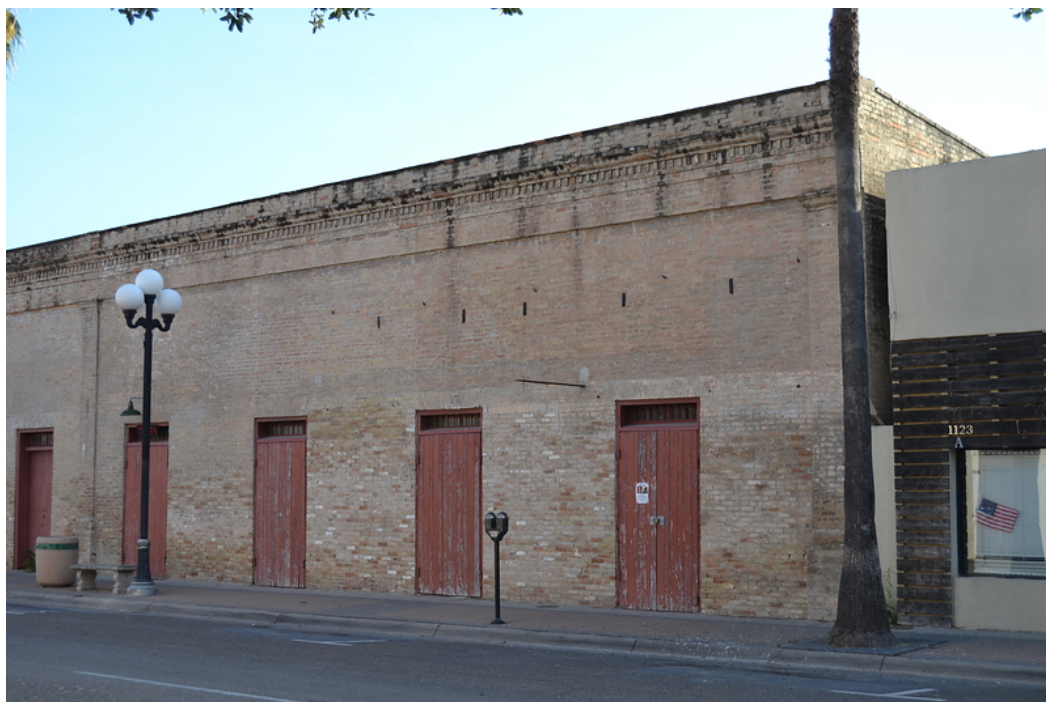
Aug 2017 Image ID 30969