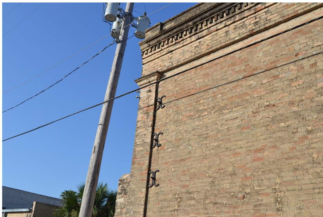
Aug 2017 Image ID 30976