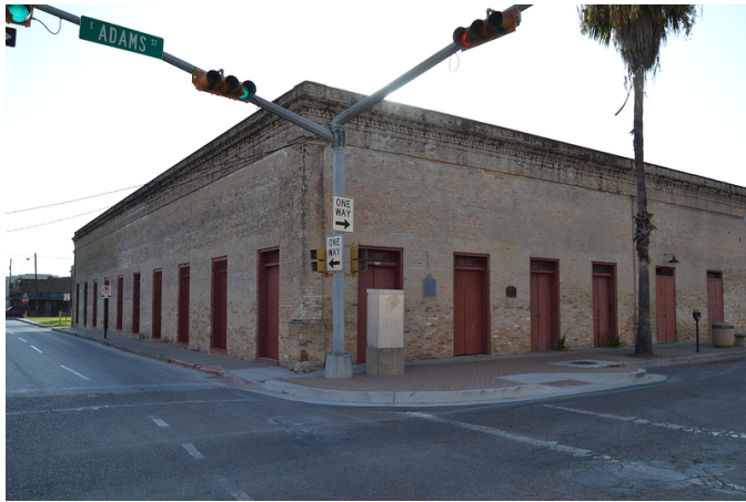
Aug 2017 Image ID 30973