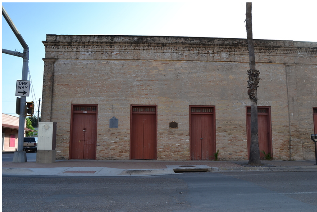
Aug 2017 Image ID 30972