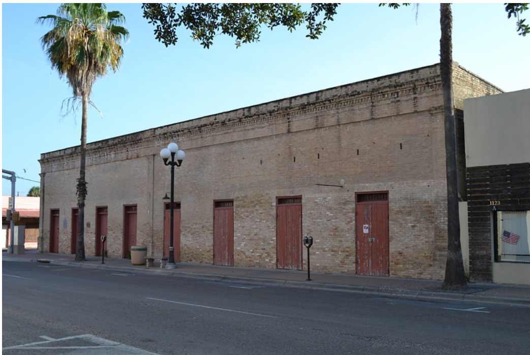
Aug 2017 Image ID 30970