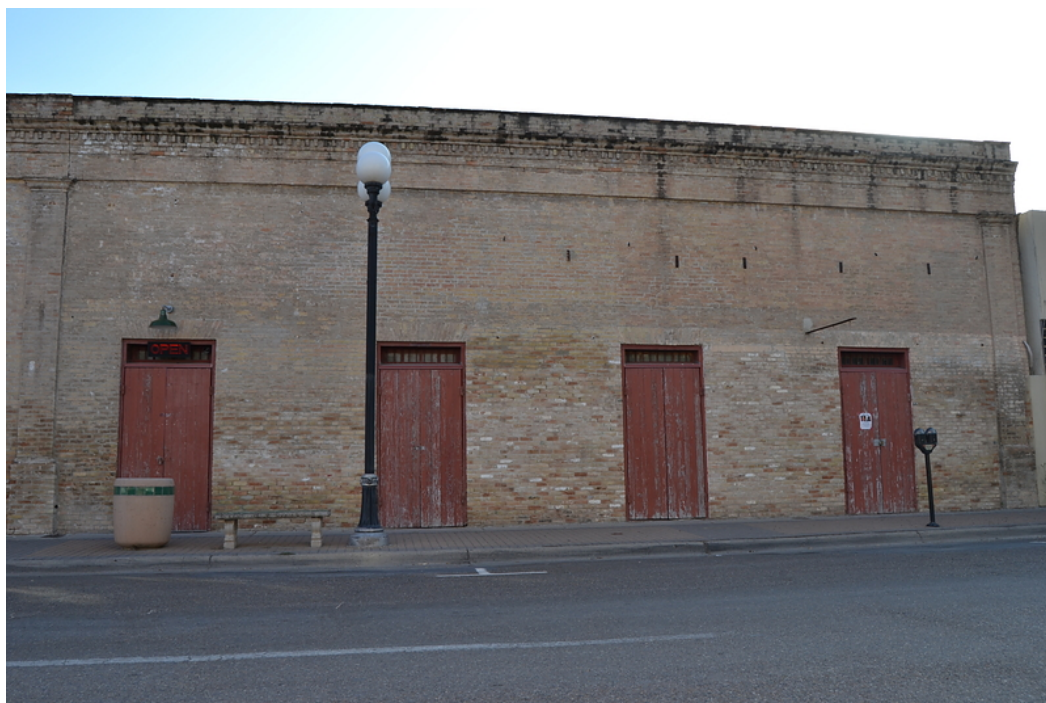
Aug 2017 Image ID 30971