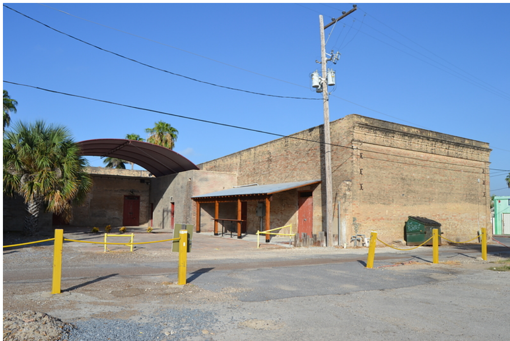
Aug 2017 Image ID 30977