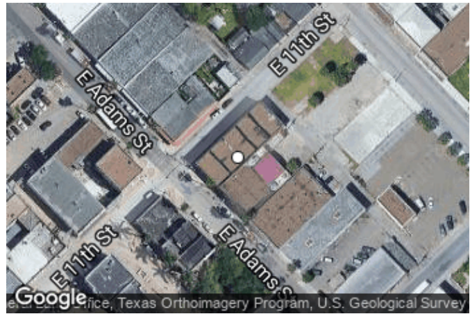
Coordinates: 25.9030036, -97.4972047