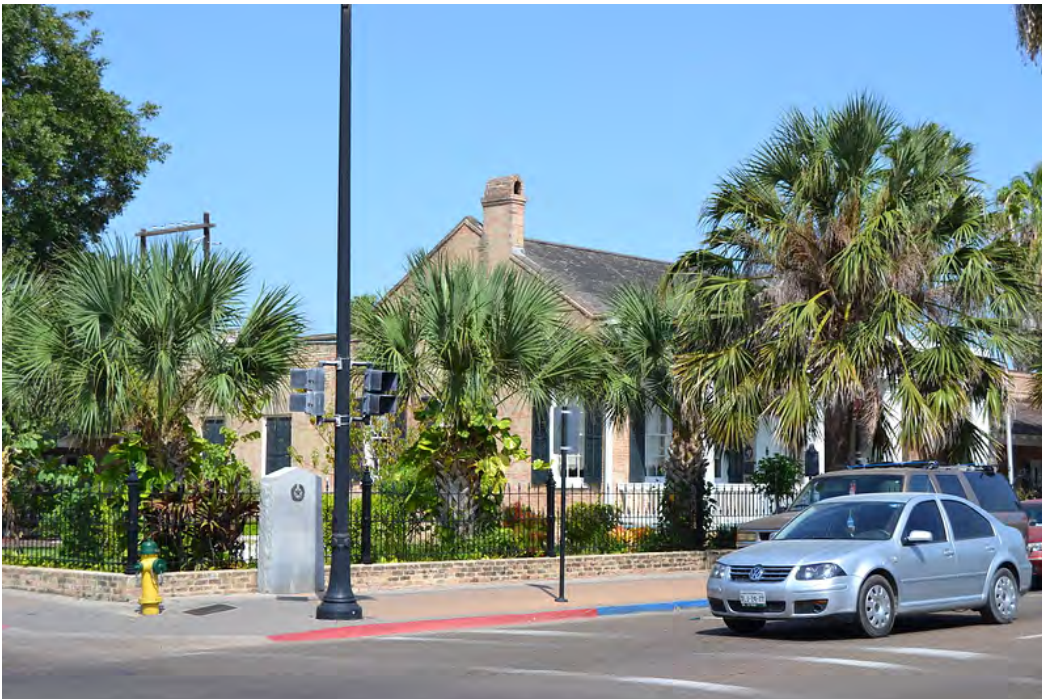
Aug 2017 Image ID 30751