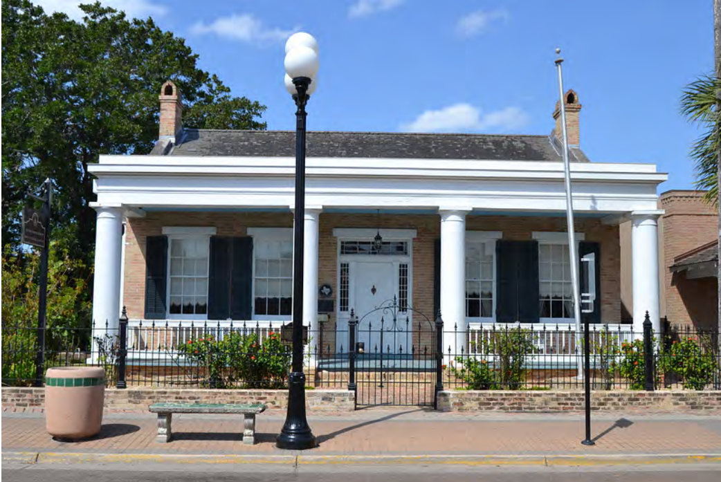
Aug 2017 Image ID 30750