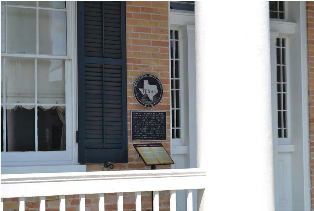
Aug 2017 Image ID 30756