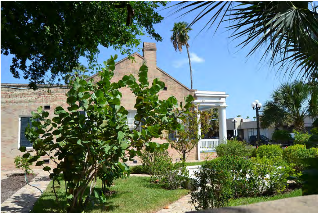
Aug 2017 Image ID 30760