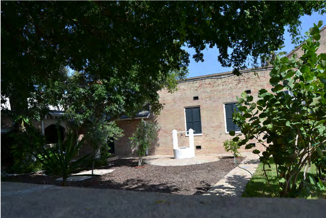
Aug 2017 Image ID 30759