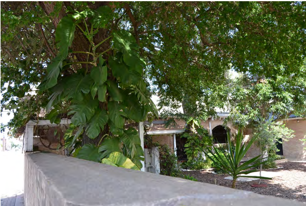
Aug 2017 Image ID 30758