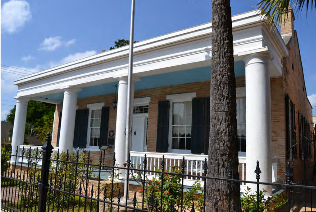
Aug 2017 Image ID 30757