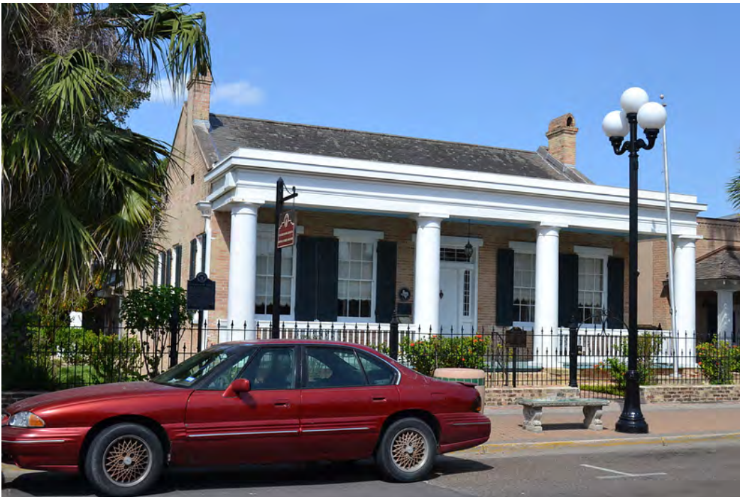
Aug 2017 Image ID 30752