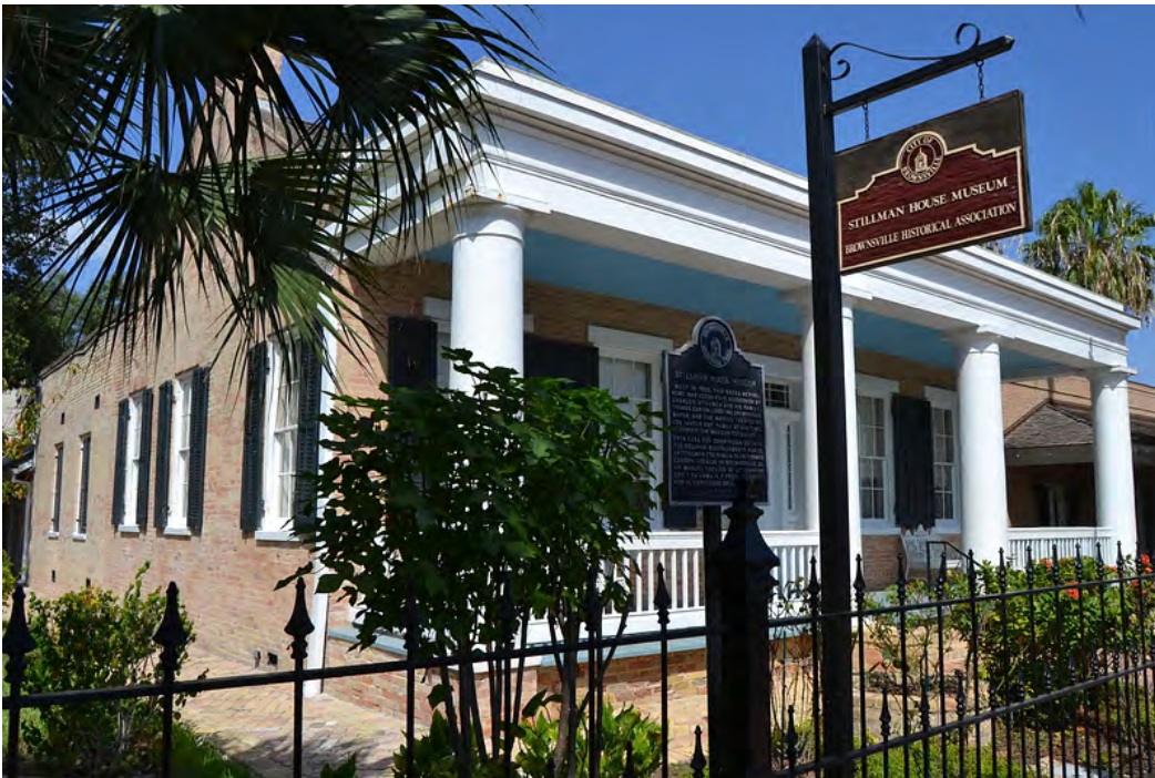
Aug 2017 Image ID 30754