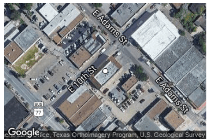
Aug 2017 Image ID 31096