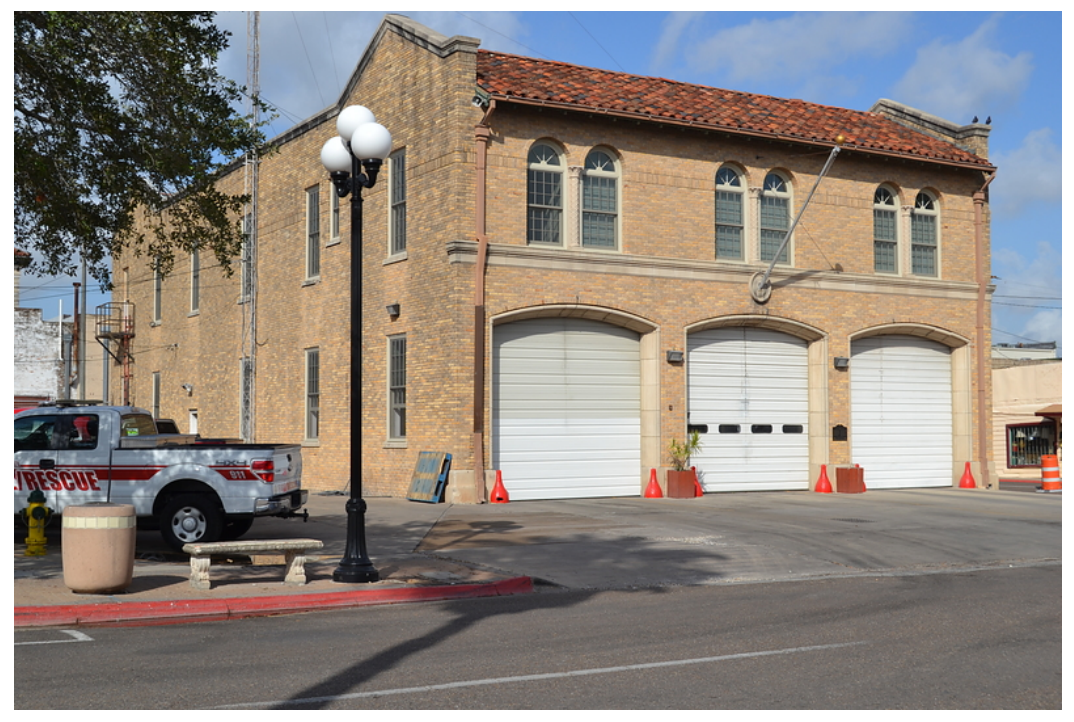
Aug 2017 Image ID 31090