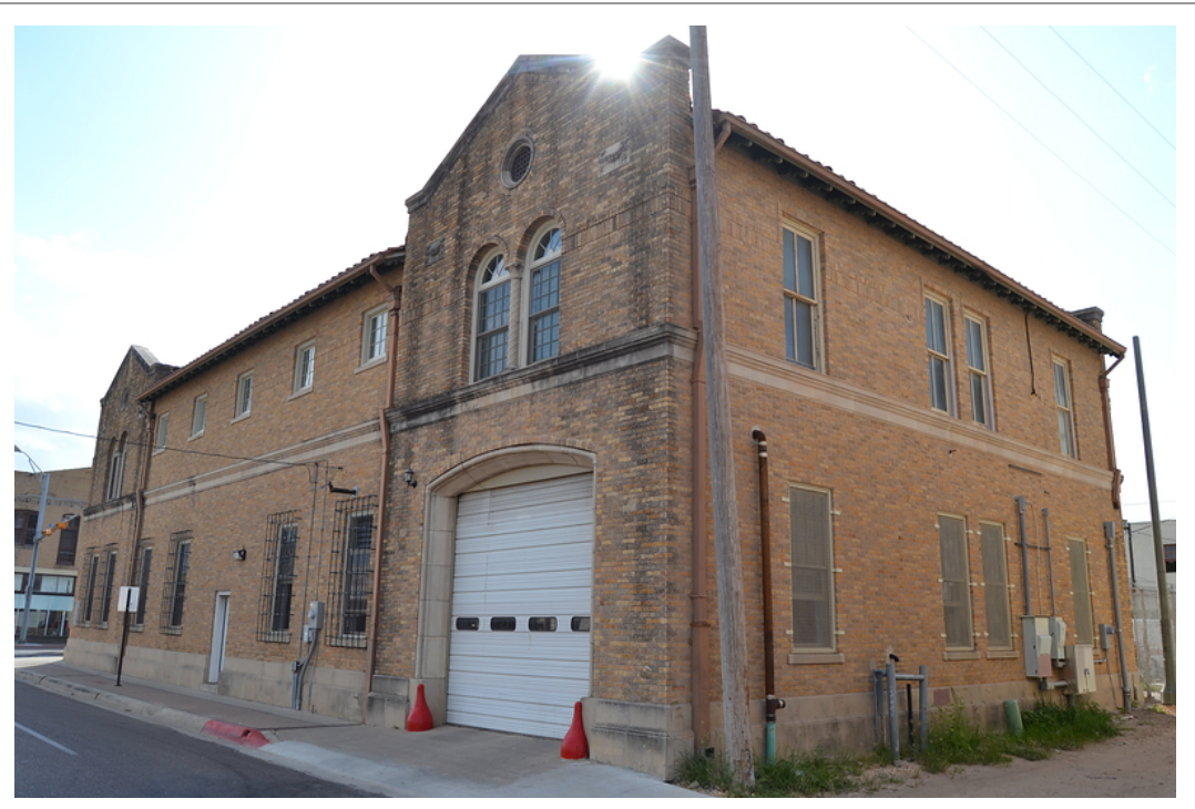
Aug 2017 Image ID 31094