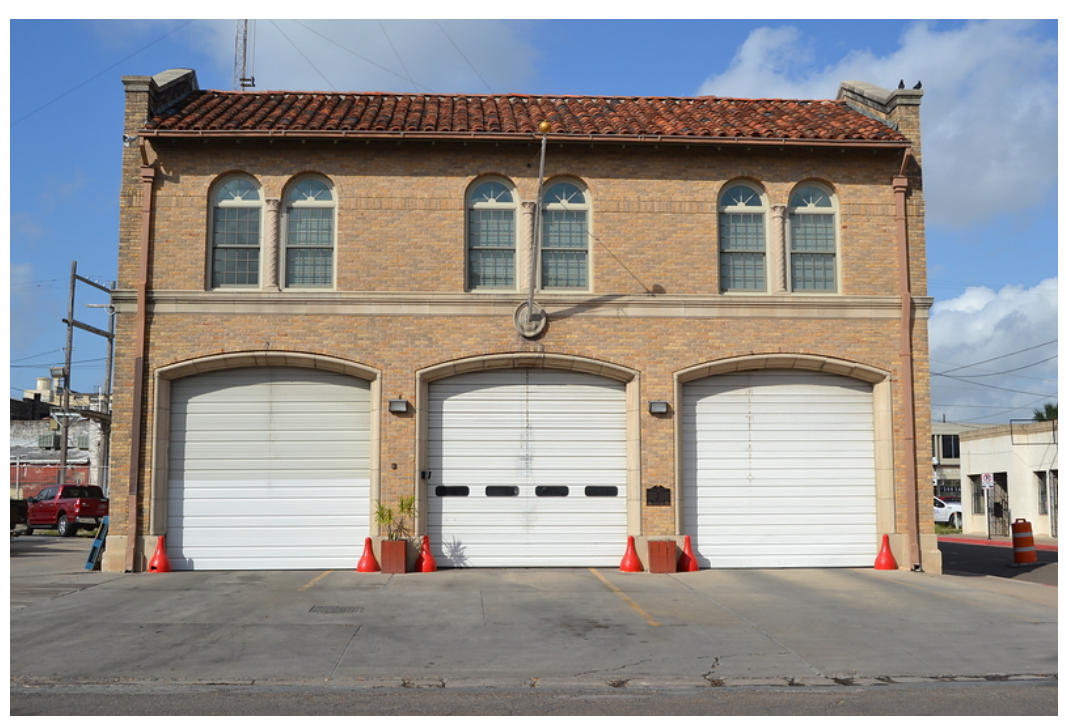
Aug 2017 Image ID 31091