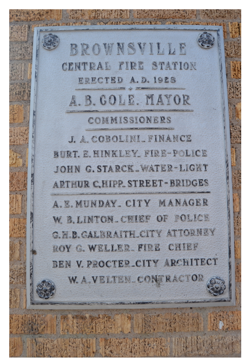
Aug 2017 Image ID 31093