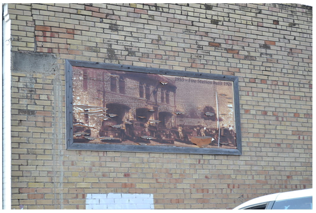
Aug 2017 Image ID 31089