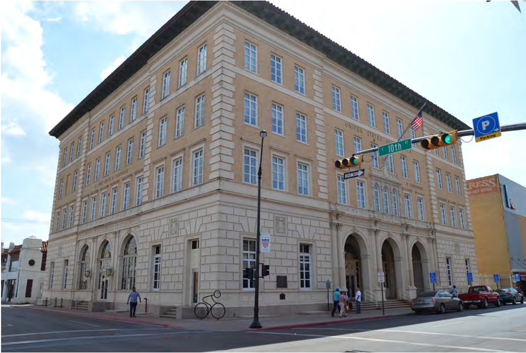
Aug 2017 Image ID 30371