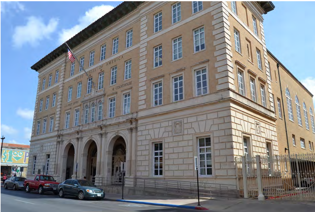
Aug 2017 Image ID 30364