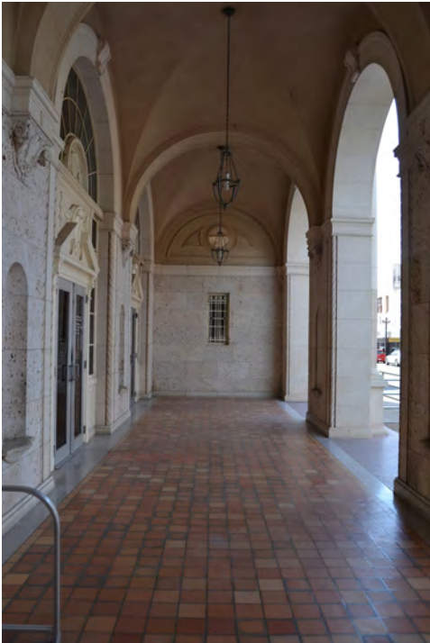
Aug 2017 Image ID 30382