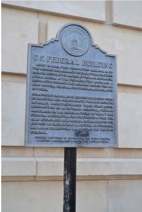
Aug 2017 Image ID 30383