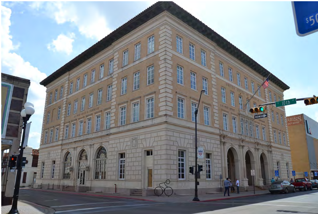
Aug 2017 Image ID 30372