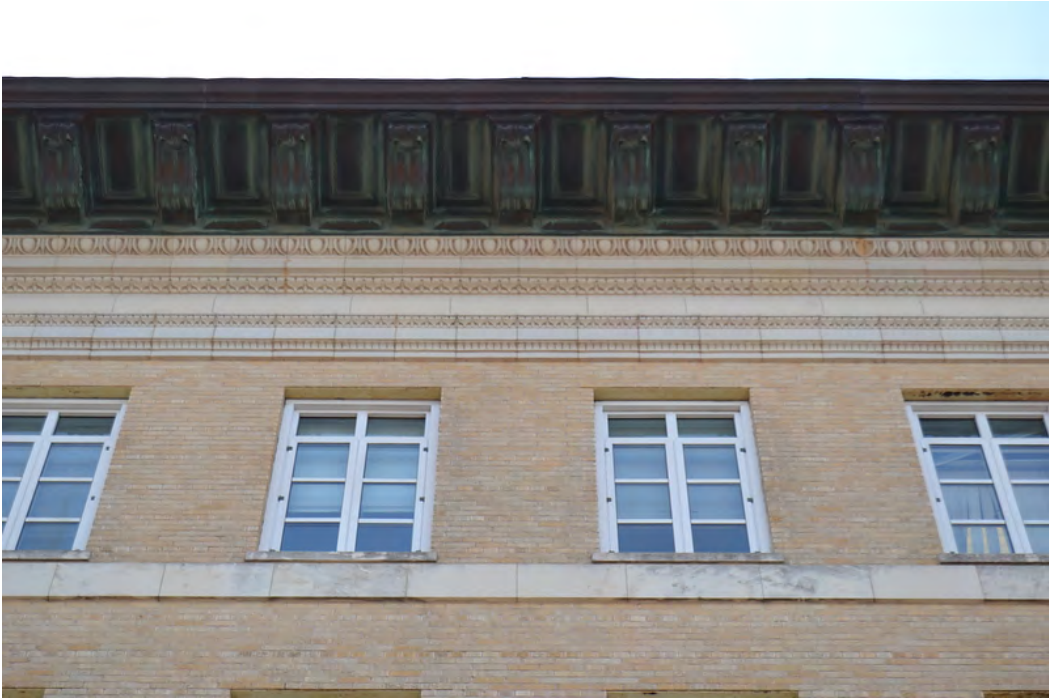
Aug 2017 Image ID 30377