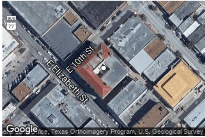
Coordinates: 25.9024583, -97.499207