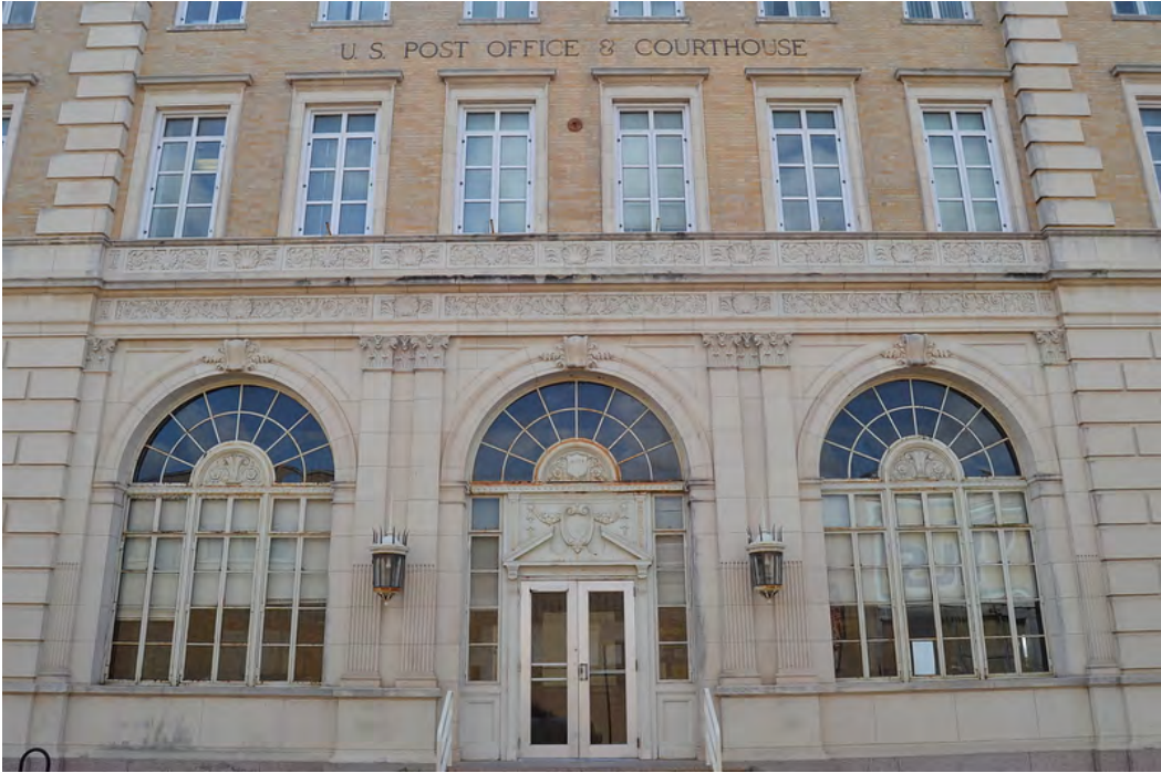
Aug 2017 Image ID 30375