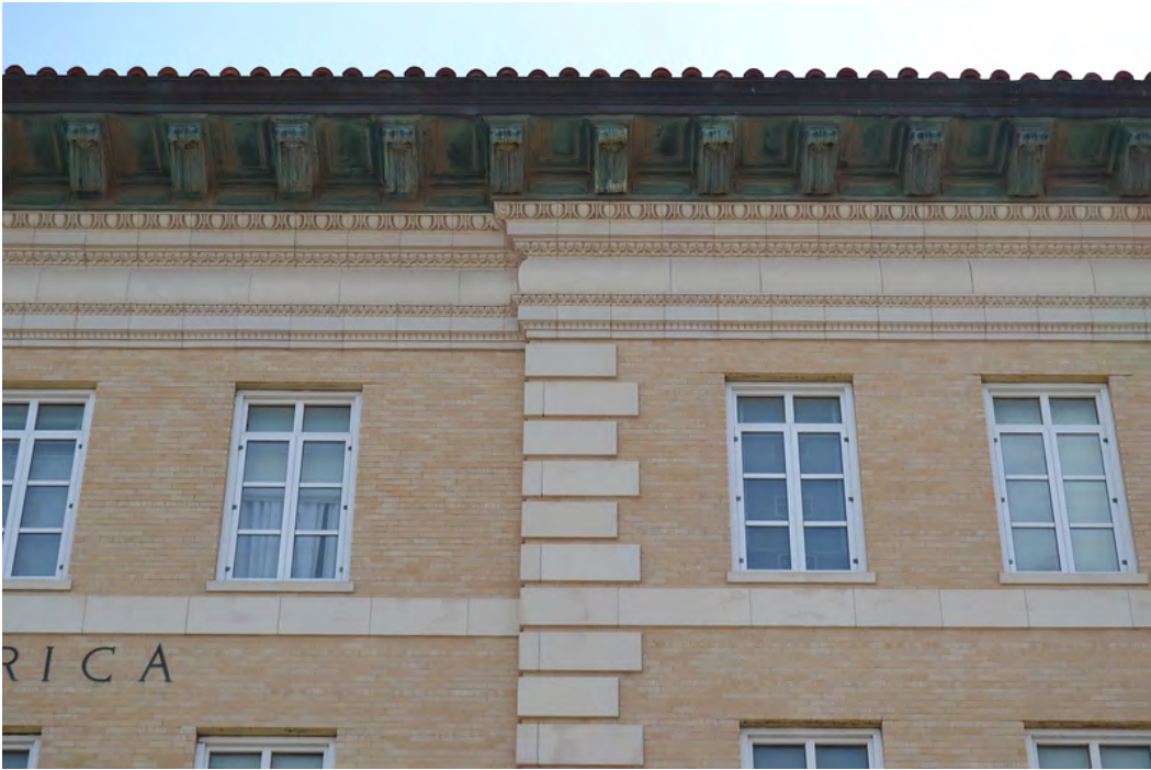
Aug 2017 Image ID 30367