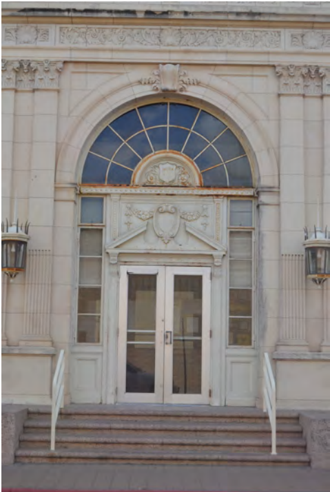
Aug 2017 Image ID 30374