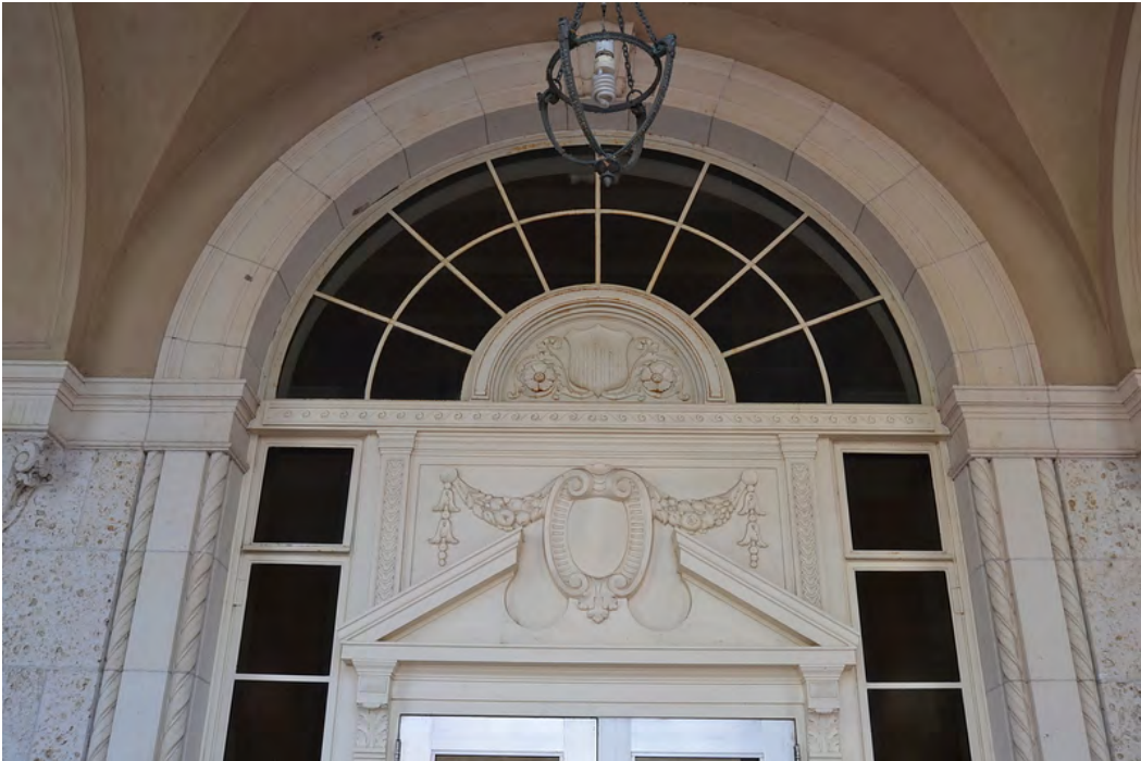
Aug 2017 Image ID 30380