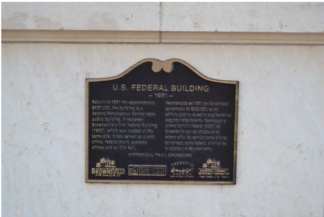
Aug 2017 Image ID 30384