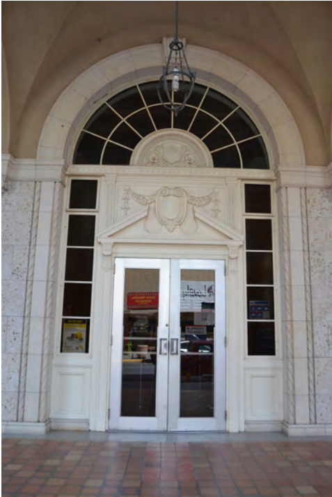
Aug 2017 Image ID 30381