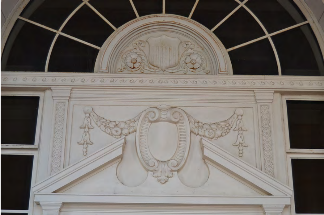
Aug 2017 Image ID 30379