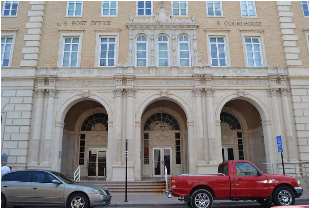
Aug 2017 Image ID 30370