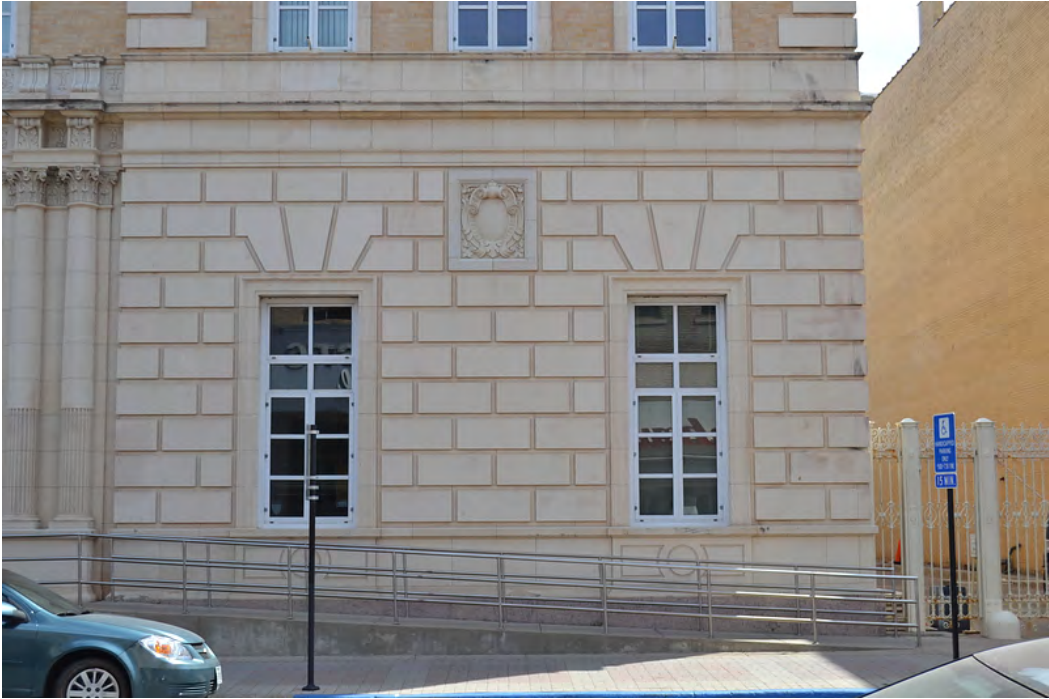
Aug 2017 Image ID 30366