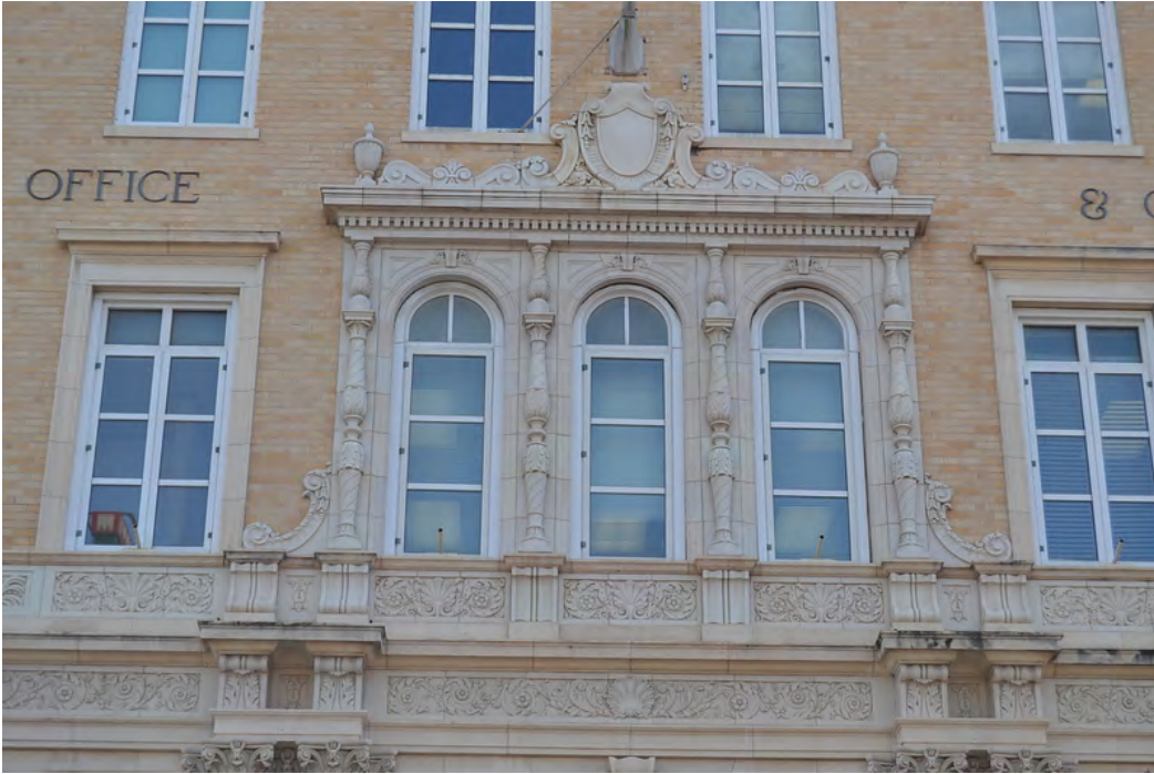
Aug 2017 Image ID 30368