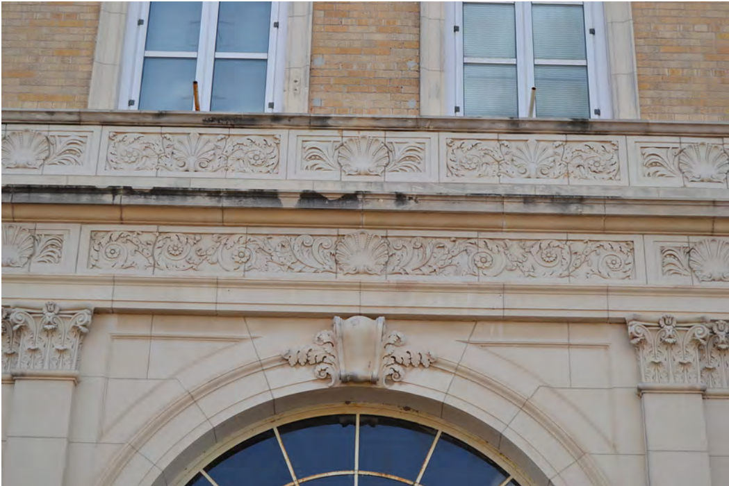
Aug 2017 Image ID 30376