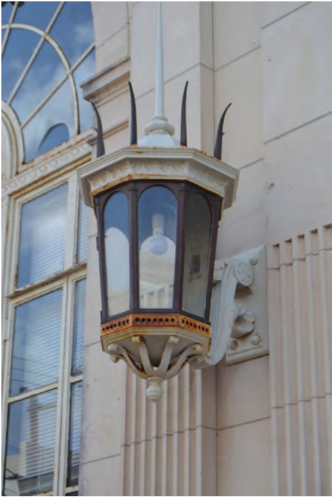
Aug 2017 Image ID 30378