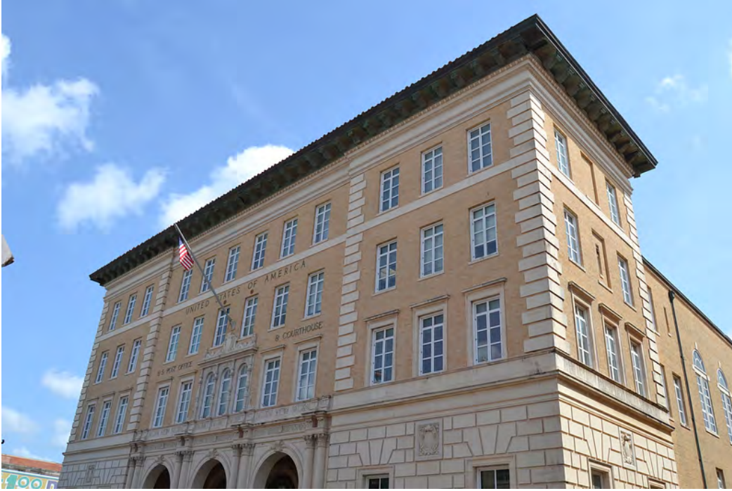
Aug 2017 Image ID 30365