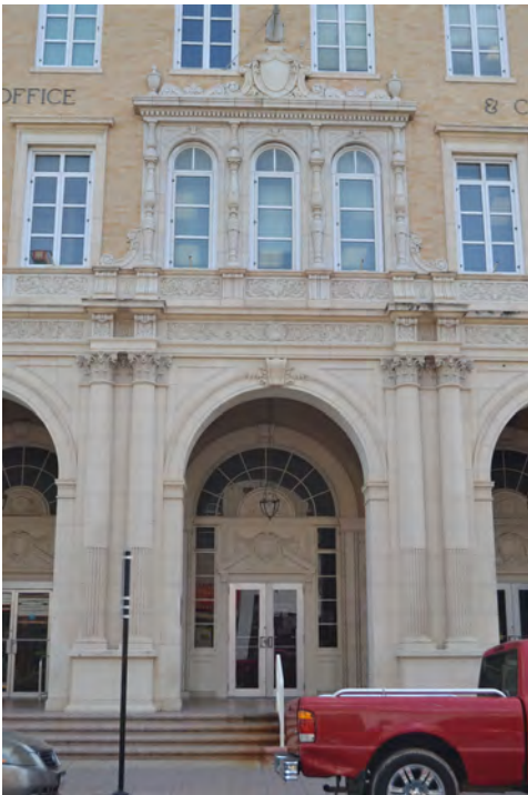
Aug 2017 Image ID 30369