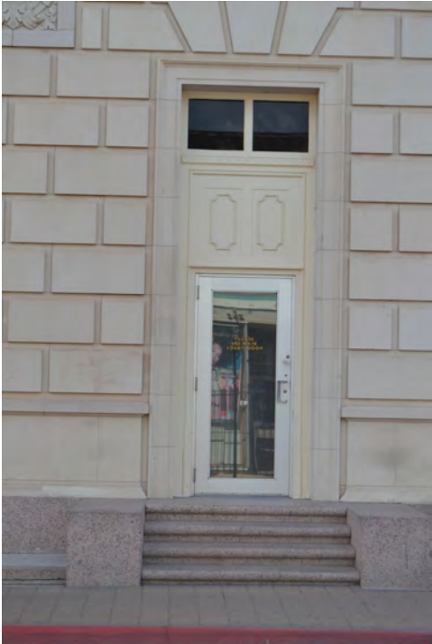
Aug 2017 Image ID 30373