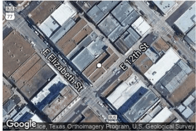
Coordinates: 25.901334, -97.4980831