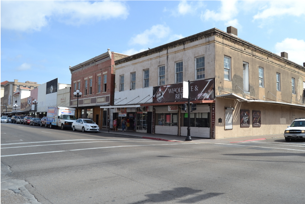
Aug 2017 Image ID 30263