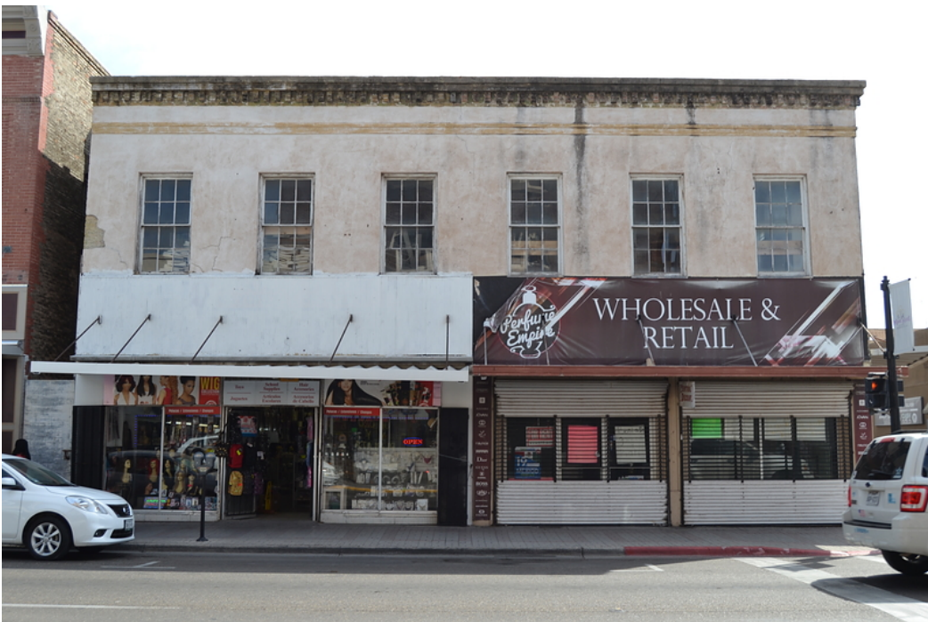
Aug 2017 Image ID 30265