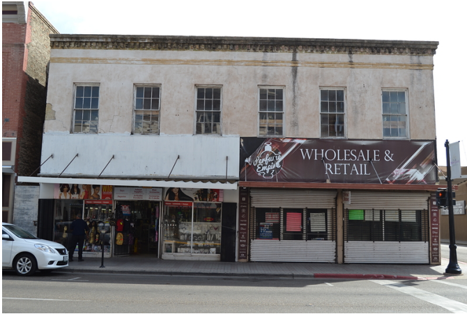
Aug 2017 Image ID 30266