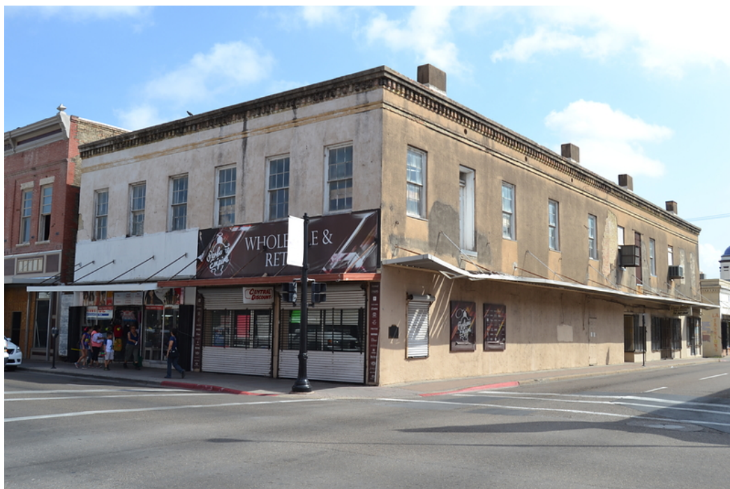
Aug 2017 Image ID 30264