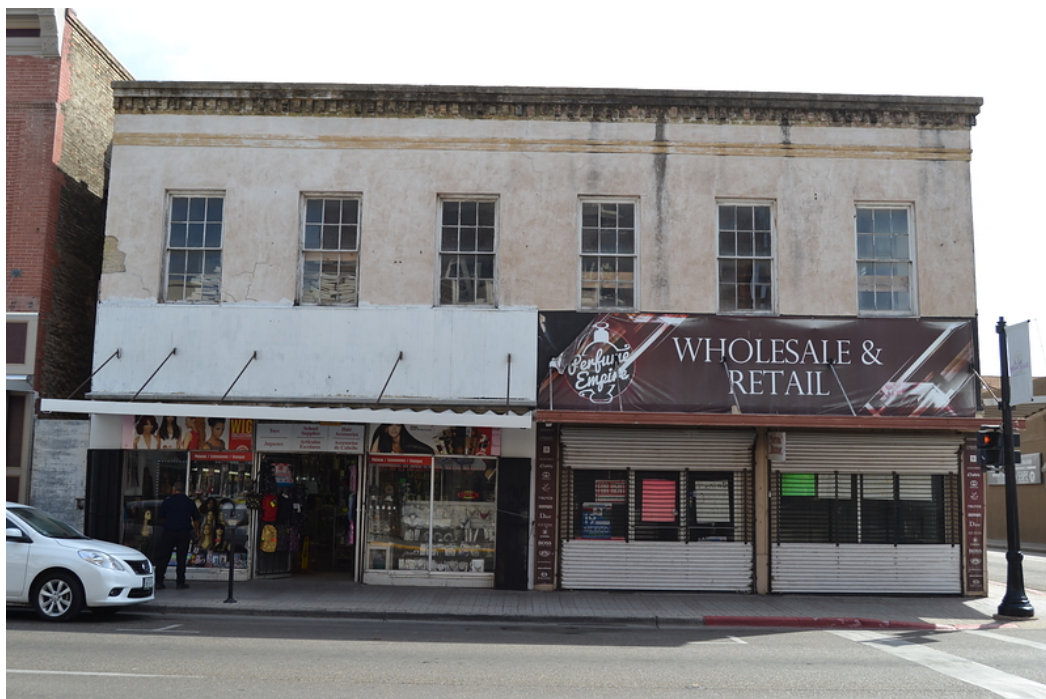
Aug 2017 Image ID 30266