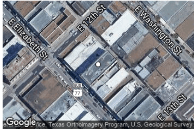
Coordinates: 25.9010022, -97.4976754