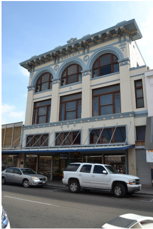
Aug 2017 Image ID 30849