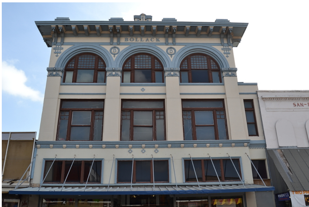
Aug 2017 Image ID 30850