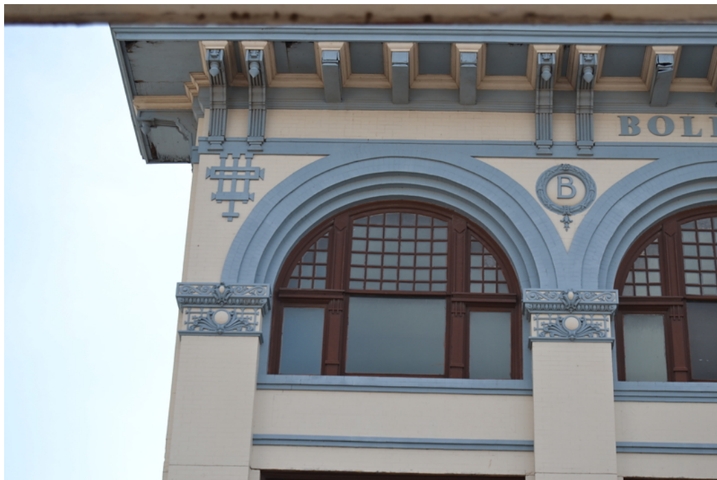
Aug 2017 Image ID 30853