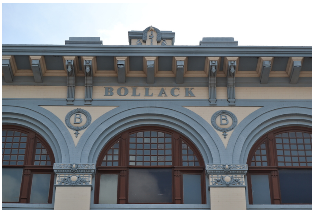
Aug 2017 Image ID 30852