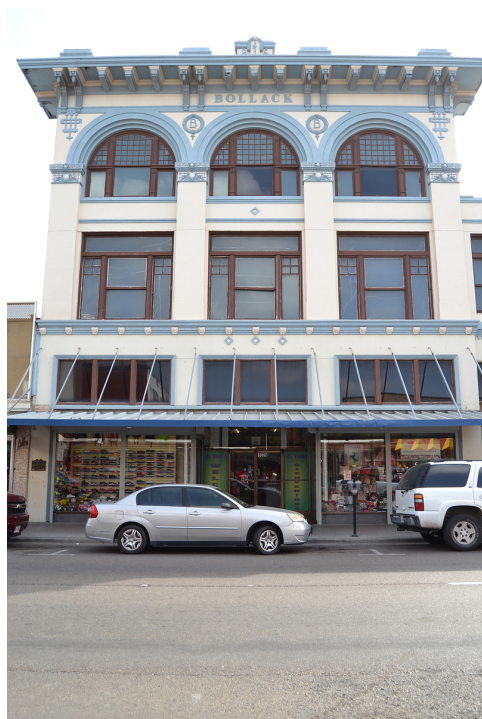
Aug 2017 Image ID 30851