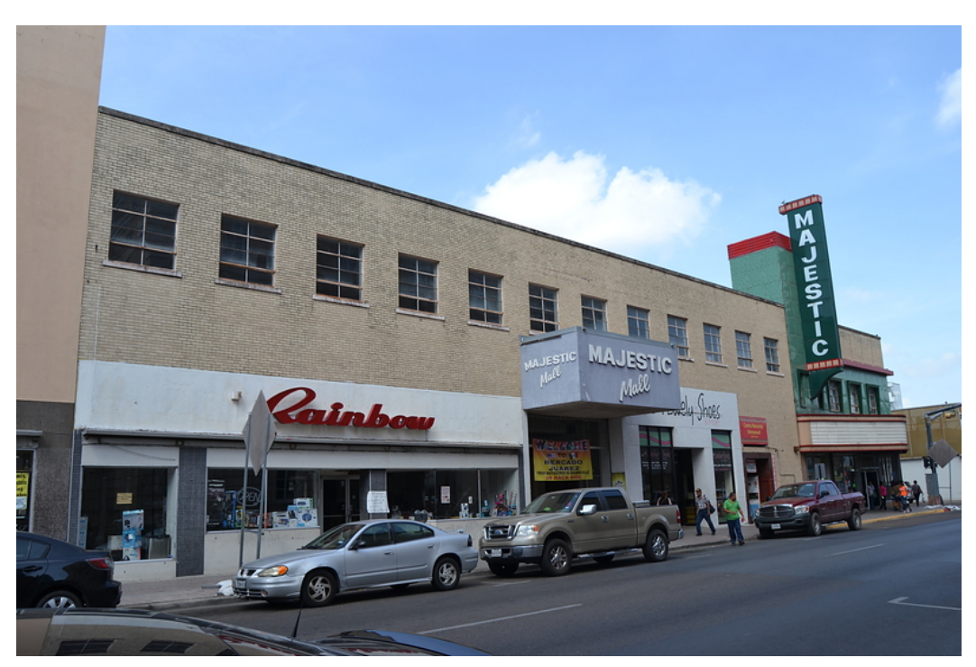
Aug 2017 Image ID 30286