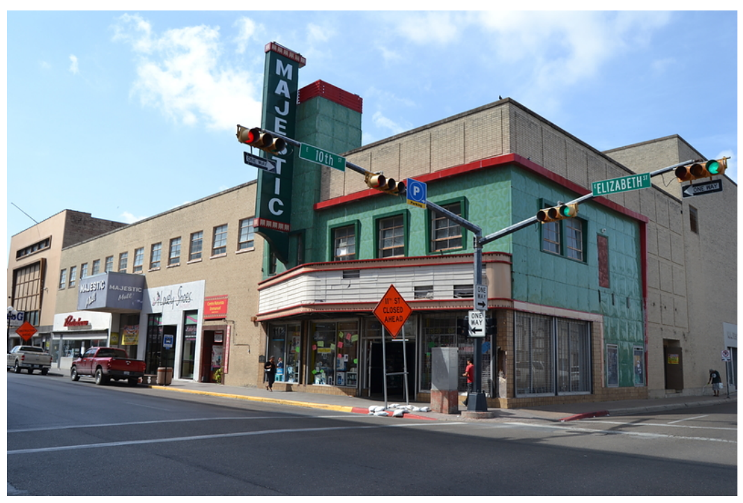
Aug 2017 Image ID 30277