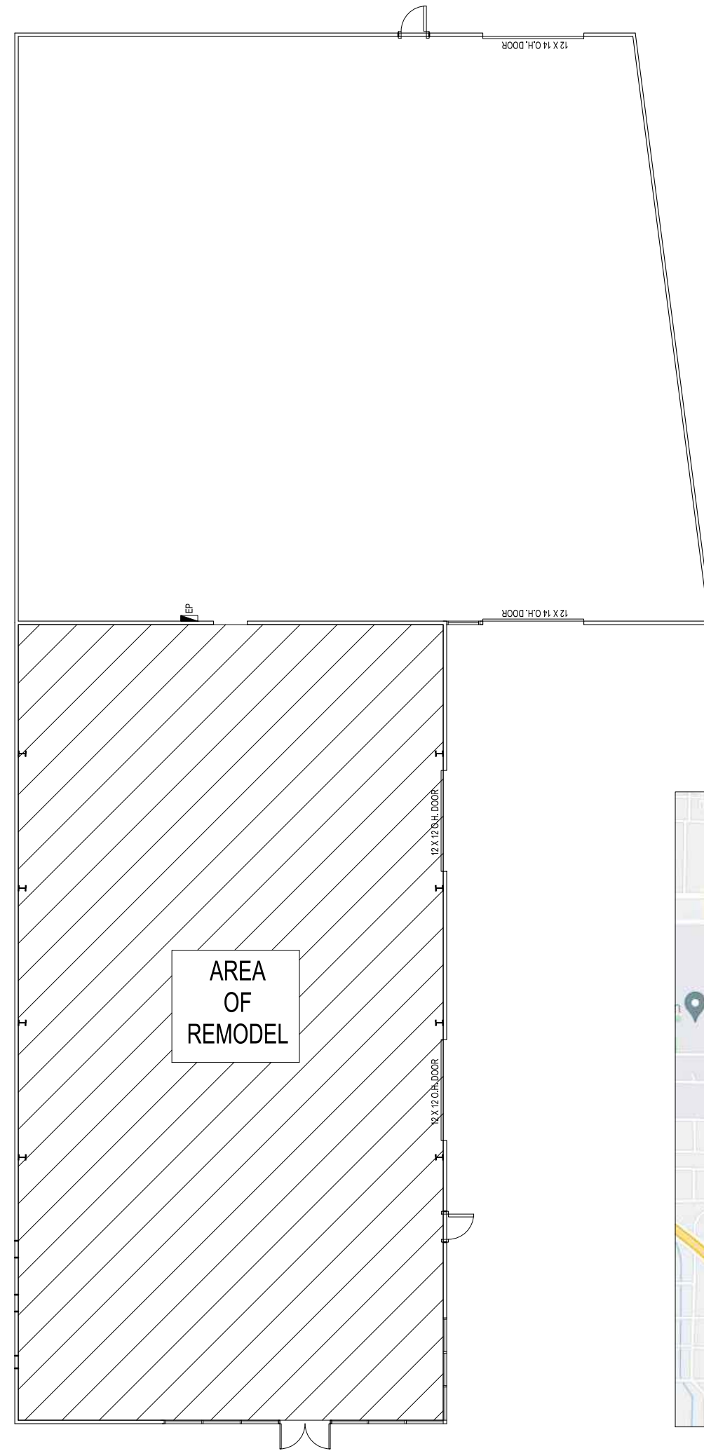
KEY PLAN SCALE: 1/16" = 1'-0"