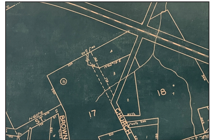
Detail from the 1935 town map showing a large part of Lot 3 is on the west side of Church Street. Church Street was extended to reach the Webb community northeast of Mansfield.