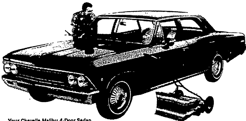
Your Chevelle Malibu 4-Door Sedan will come with eight safety features now standard, like seat belts, front and rear. Always buckle up.

Your Chevrolet dealer is mowing prices right now!