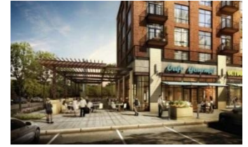
Figure 1: Outdoor Cafe