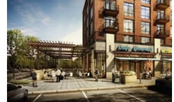
Figure 1: Outdoor Cafe