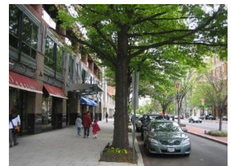
Figure 3: Streetscape should maximize tree canopy.

The Board retains the ability to alter requirements specified under these standards for individual projects. Applicant can request consideration of alternative design solutions to achieve intended goals. Designs must adhere to the Coding and Zoning requirements from the City of Corpus Christi.